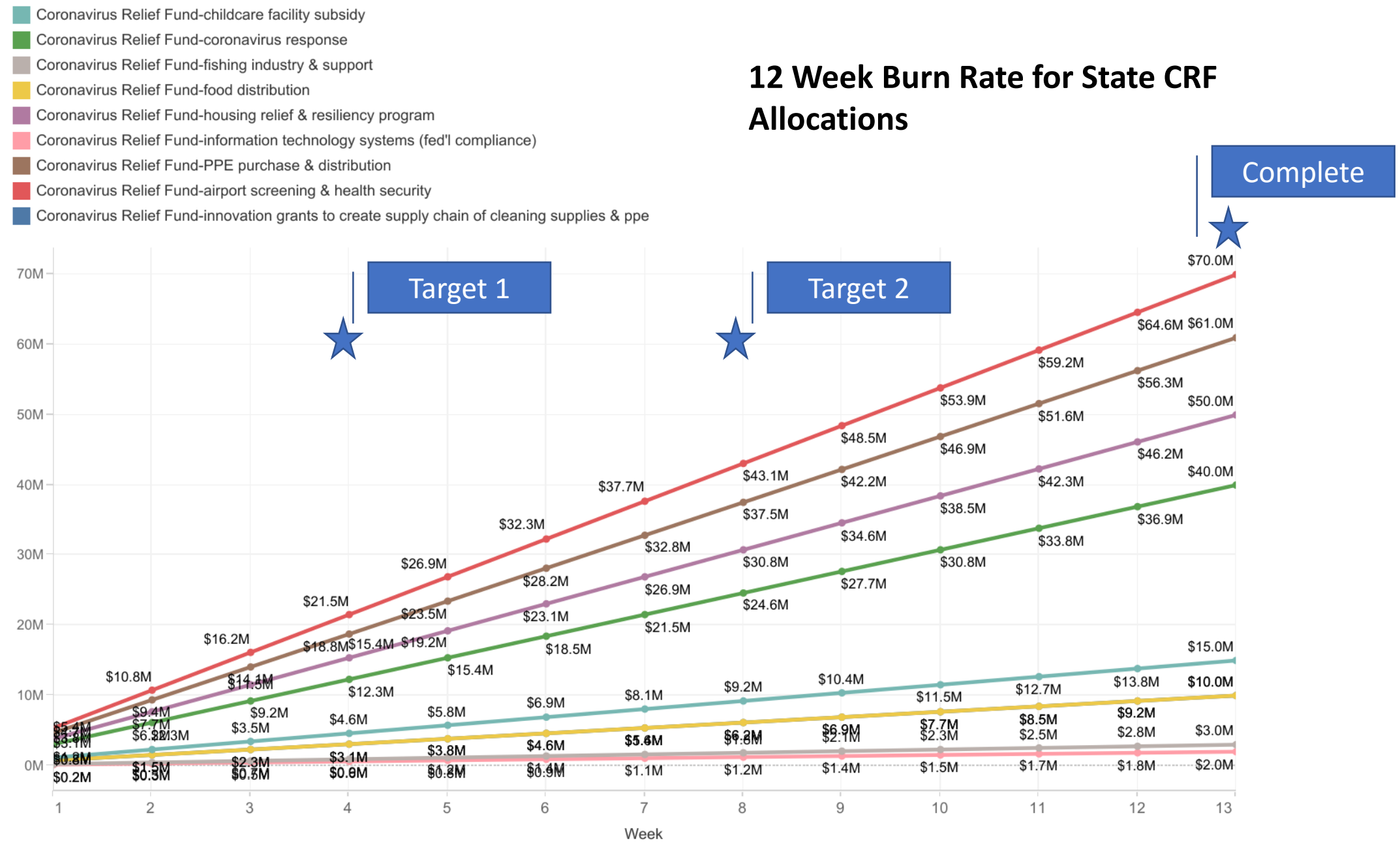
*older chart reflected 13 wk spend down & $50M for housing vs $100M